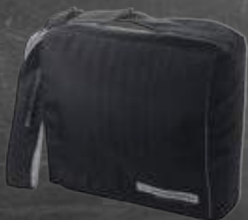
The soft carrying case

The AS608 / AS608e will operate with 3 standard AA batteries or a medically approved external power supply. Typical battery life is six months.